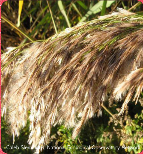
Caleb Slemmons, National Ecological Observatory Network